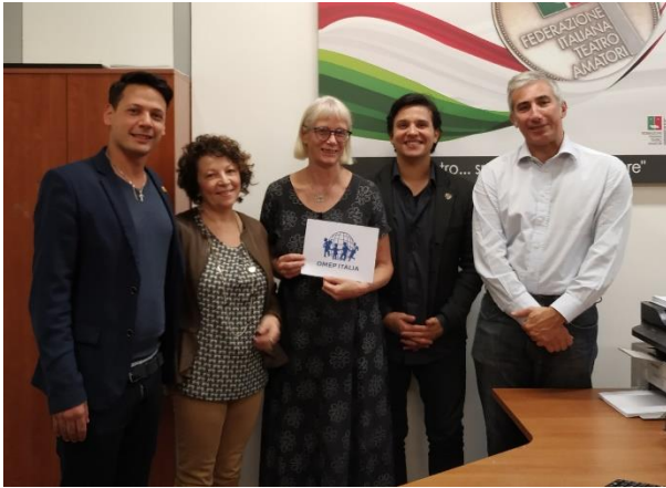
Parts of the OMEP preparatory committee in Rome, in October 2019.

Later, at a committee meeting with OMEP Italy we discussed the role of OMEP and the fact that many OMEP national committees are welcoming Italy back into OMEP. In addition to describing the roots of OMEP Italy, the committee is discussing a possible project for OMEP Italy, as well as considering the world projects.